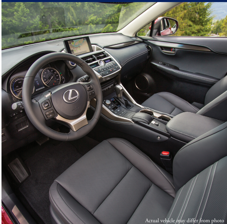
Actual vehicle may differ from photo

Proceeds from the 2018 Lexus Opportunity Drawing provide vital support for the Japanese American National Museum's educational programming and outreach activities.